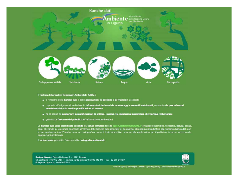
New Interface Observatories on Liguria Region website

The inventory refers to the following years: 1995, 1999, 2001, 2005, 2008 and 2011 and the Energy balances are available for 2005, 2008 and 2011.